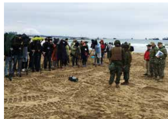
Members of the media record actions during Operation Pacific Reach.