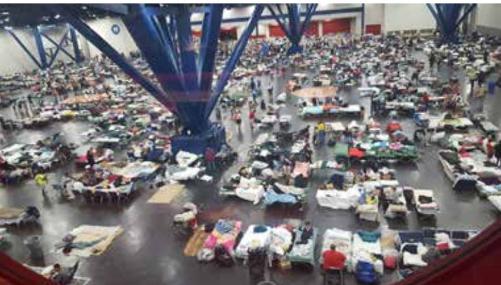
A Houston-area emergency shelter in the aftermath of Hurricane Harvey.

“There is a very long, difficult road to travel ahead,” he said. “There is still flooding going on, and many families have lost all they had. The people of Texas, however, will make it. We have a great deal of pride and a can do attitude.”