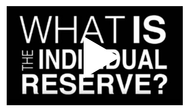
Watch the "What is the Individual Reserve" video on YouTube: <u>https://youtu.be/r0bMSNnYhUE</u>.

HQ RIO standardizes the processes for the Individual Reserve program. The IR force is comprised of Individual Mobilization Augmentees (IMAs), who are accountable to the Air Force Reserve Command and assigned to funded, active-component positions, and Participating Individual Ready Reservists (PIRRs), who participate for points towards retirement only. There are more than 2,700 enlisted members and more than 4,500 officers in the IR. IMAs and PIRRs support more than 50 major commands, combatant commanders and government agencies.