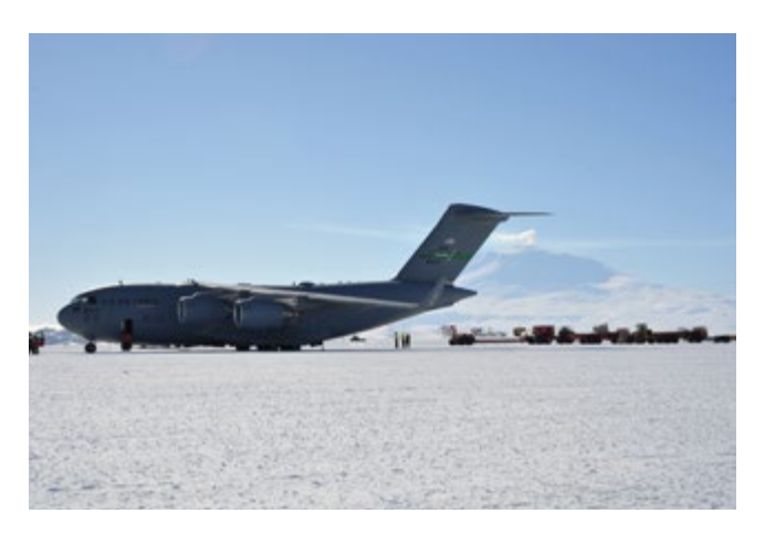
A C-17 Globemaster III sits in the frigid cold near McMurdo Station in Antarctica on Feb. 9, 2018. Members of the 304th Expeditionary Airlift Squadron operated aircraft while supporting the U.S. Antarctic Program through Operation Deep Freeze.

In addition to supporting ODF, members of the 304th EAS participated in the City of Christchurch's biannual IceFest, which allows the New Zealand population to celebrate