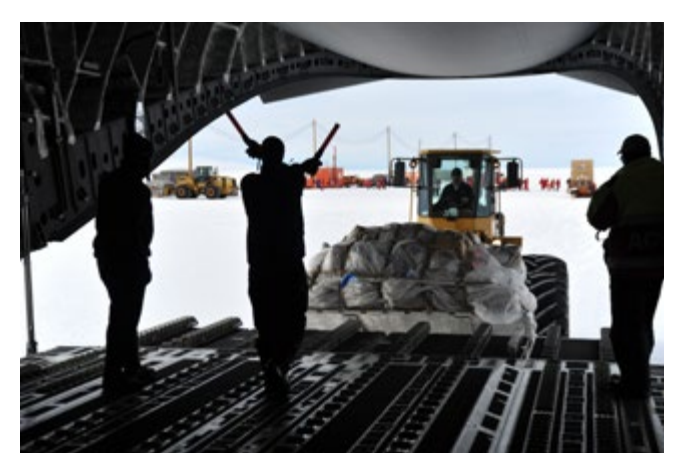
Cargo is loaded onto a C-17 Globemaster III on Feb. 9, 2018, near McMurdo Station in Antarctica. Members of the 304th Expeditionary Airlift Squadron operated aircraft while supporting the U.S. Antarctic Program through Operation Deep Freeze.

Because of their efforts, Airmen from the 304th EAS opened a new capability to support science and research conducted by the U.S. Antarctic Program by providing year-round access to the polar continent through mid-winter flights. This extended operating season enables additional experiments to be performed in the sub-zero temperatures at McMurdo Station.