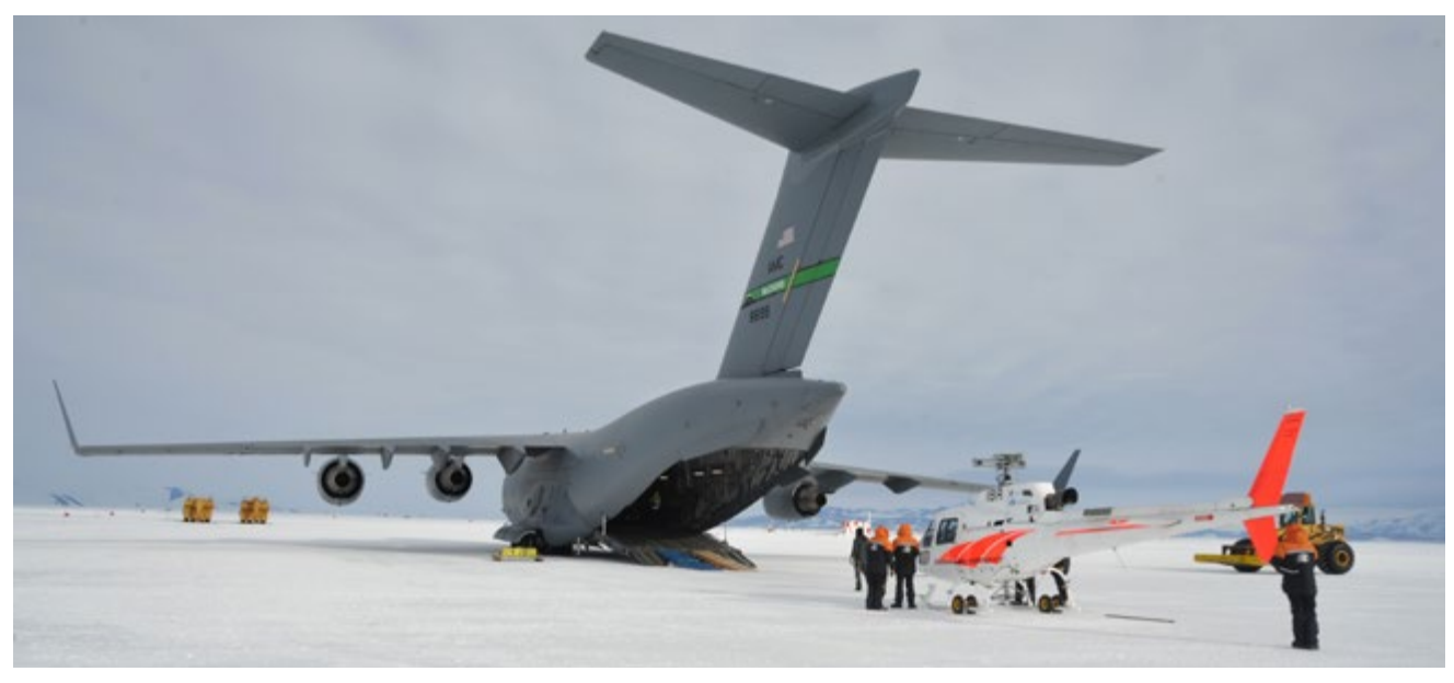
A Bell 212, operated by Antarctic New Zealand, is prepared to be loaded onto a C-17 Globemaster III Feb. 17, 2018 near McMurdo Station in Antarctica. Members of the 304th Expeditionary Airlift Squadron operated aircraft while supporting the U.S. Antarctic Program through Operation Deep Freeze. (Courtesy Photo)

By Staff Sgt. Daniel Liddicoet, 446th Airlift Wing Public Affairs