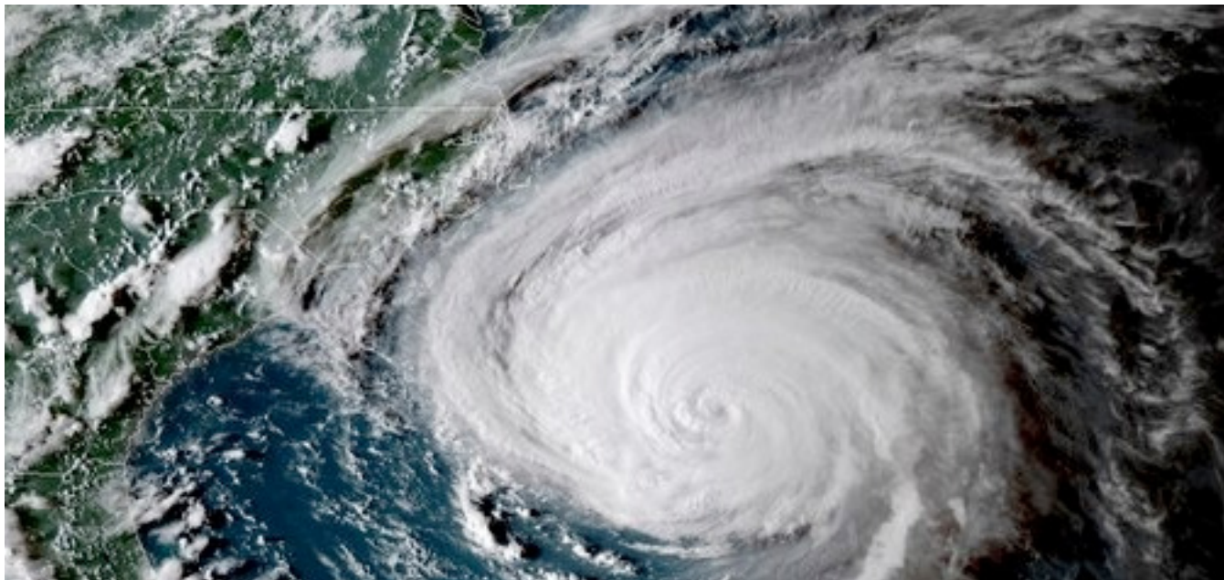
This enhanced satellite image made available by NOAA shows Hurricane Florence off the eastern coast of the United States at 5:52 p.m. EDT on Wednesday. (NOAA via AP)

By Master Sgt. Eric Amidon, Headquarters Individual Reservist Readiness and Integration Organization