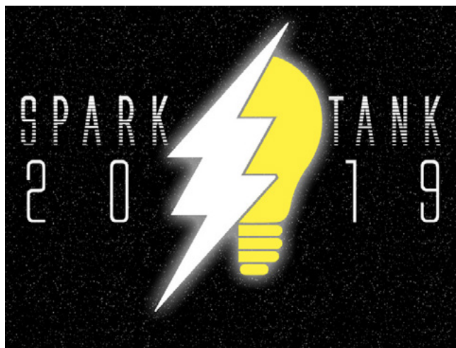
Spark Tank 2019. (U.S. Air Force photo illustration by Air Force)

By Staff Sgt. Rusty Frank, Secretary of the Air Force Public Affairs