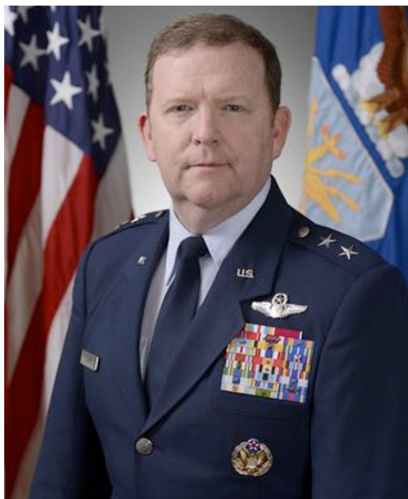
Official Air Force Image: MGen Richard Scobee Bio Photo

For complete guides on TRICARE programs, visit the Military.com TRICARE section .